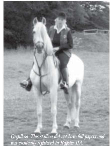
Orgulloso. This stallion did not have full papers and was eventually registered in Register IIA