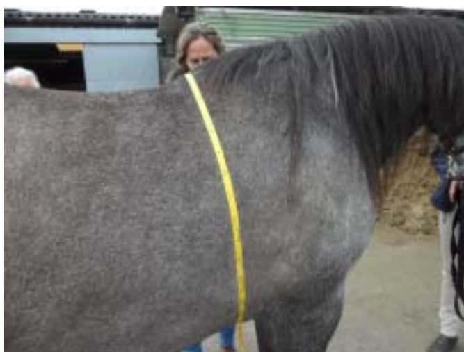
23. THORACIC PERIMETER