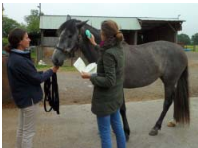
1. IDENTIFICATION OF HORSE - using the passport to check the markings and scanning for the microchip