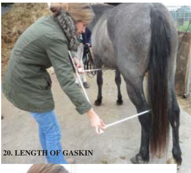
20. LENGTH OF GASKIN