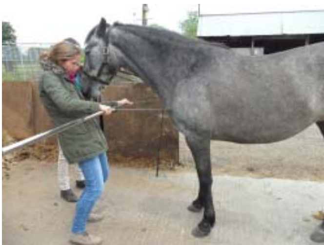
9. WIDTH OF CHEST