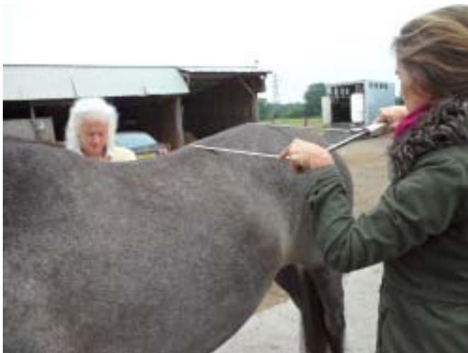
15. LENGTH OF LOIN