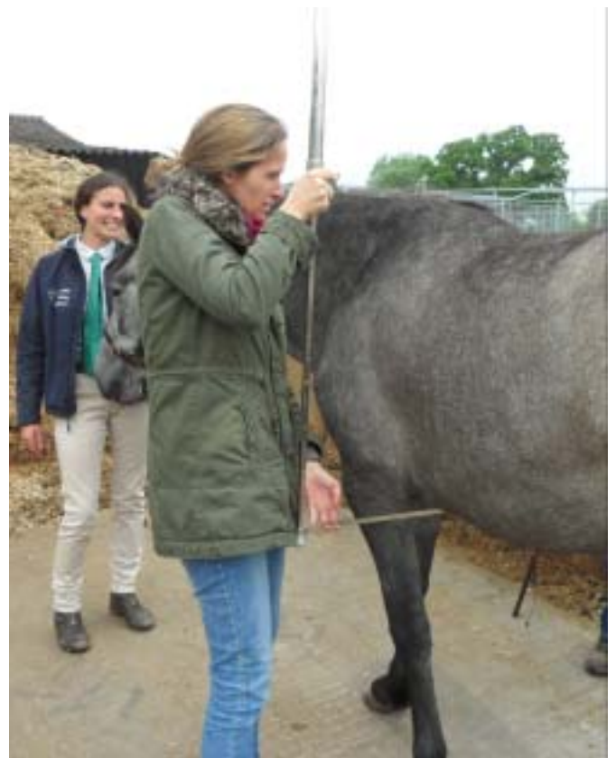
12. DORSAL-STERNAL DIAMETER