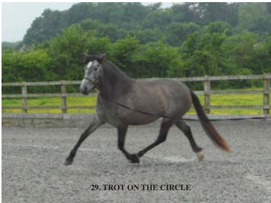
29. TROT ON THE CIRCLE