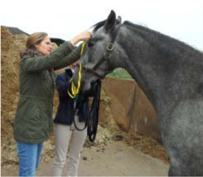
7. WIDTH OF HEAD - USING CLOTH TAPE MEASURE