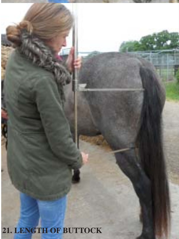
21. LENGTH OF BUTTOCK