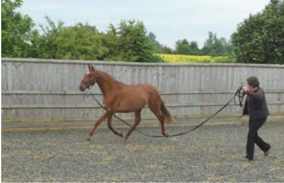
30. TROT - IN A STRAIGHT LINE. This is a good example of how to present your horse at the trot.