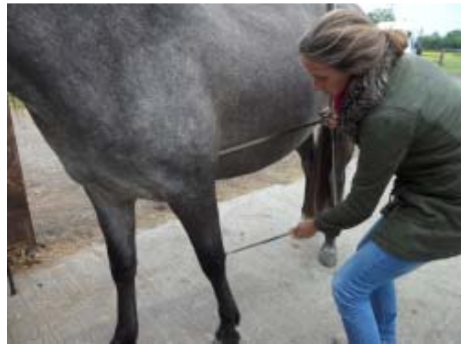
11. LENGTH OF FOREARM