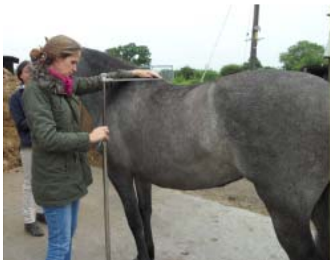
3. HEIGHT AT WITHERS - LOWEST POINT