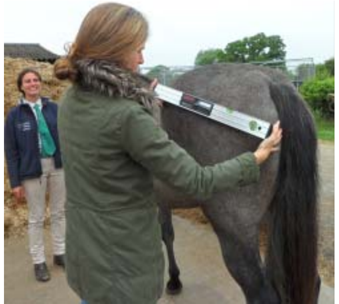
27. ANGLE OF CROUP