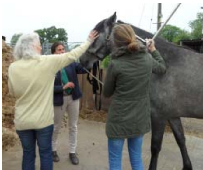
6. LENGTH OF HEAD