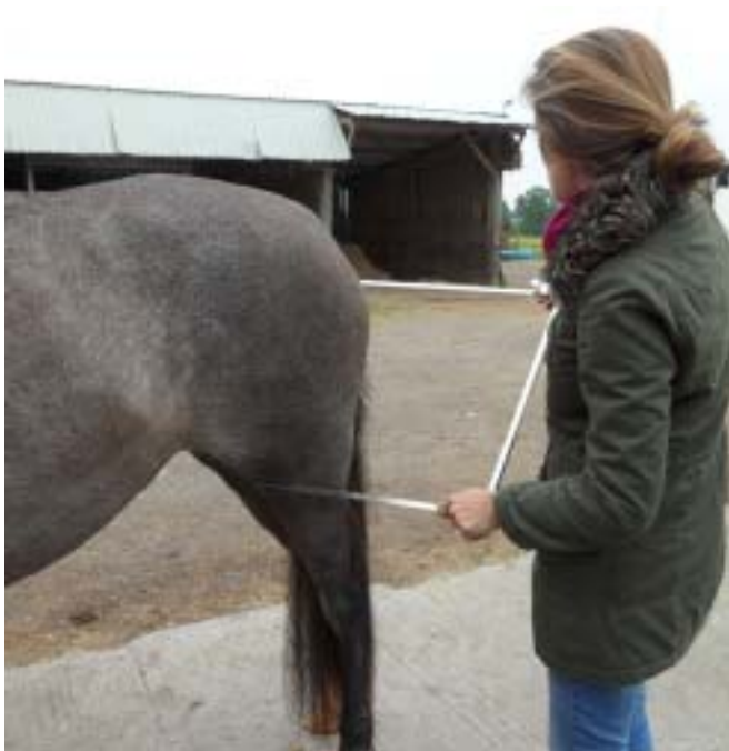
19. BUTTOCK-STIFLE DISTANCE