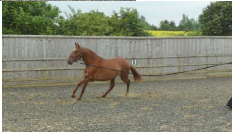
32. Below:- CANTER ON THE LUNGE Close up of a relaxed, rounded, and happy mare doing her canter circles.