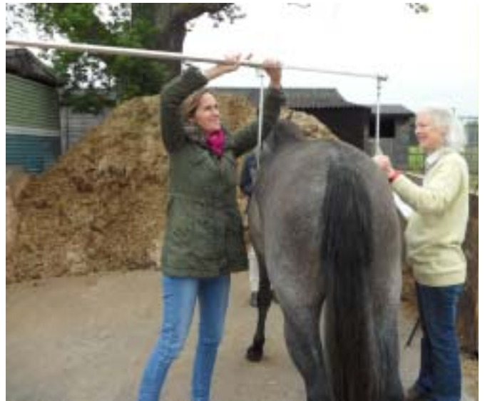
16. WIDTH OF CROUP