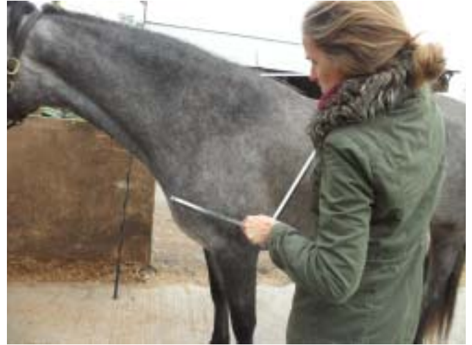
10. LENGTH OF SHOULDER