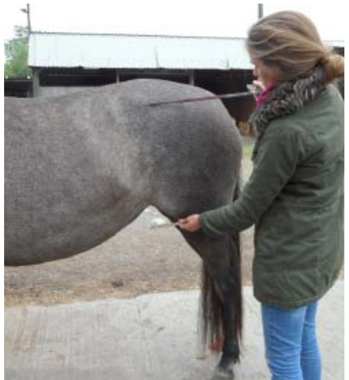
18. HIP-STIFLE DISTANCE