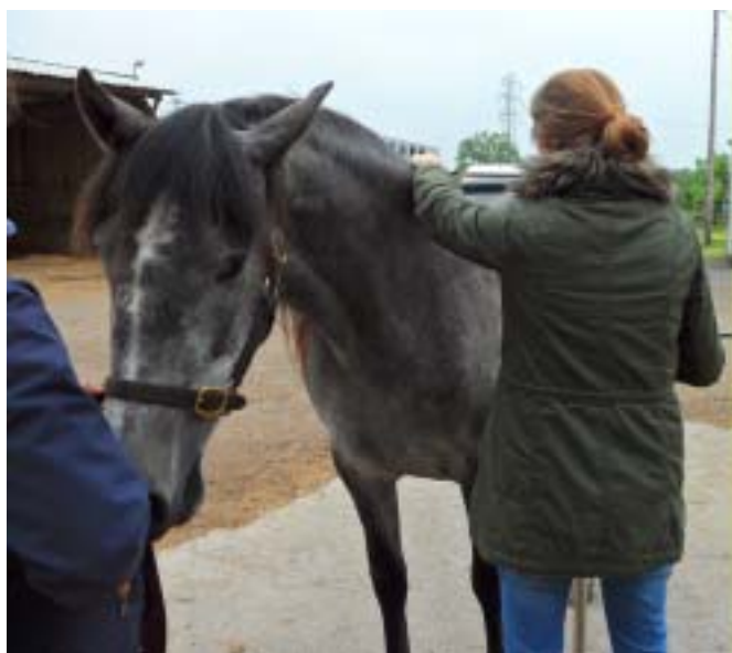
2. HEIGHT AT WITHERS - at highest point - minimum for mares is 152cm, minimum for stallions is 154 cm. Below these heights is instant failure.