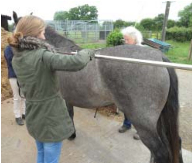
14. LENGTH OF BACK