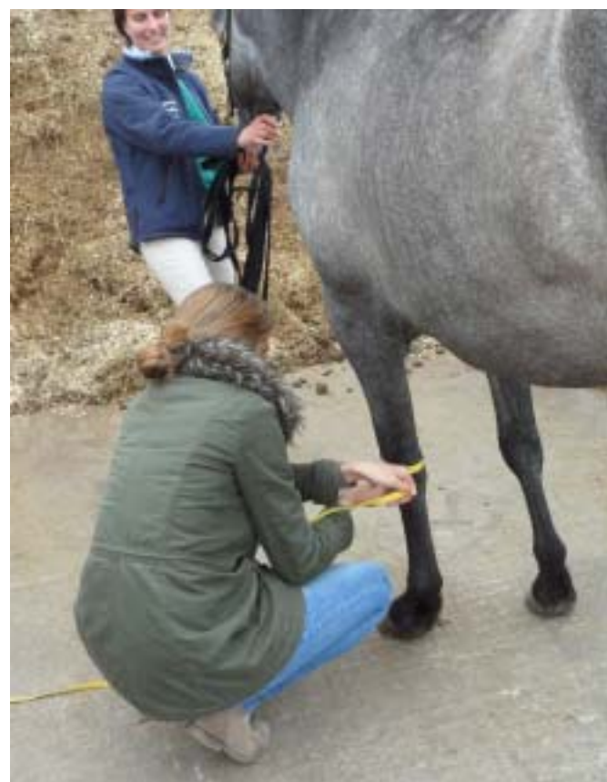
24. PERIMETER OF KNEE