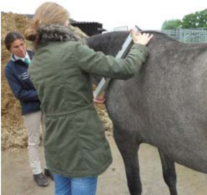
26. ANGLE OF SHOULDER