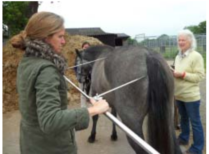
17. LENGTH OF CROUP