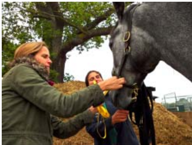
22. LENGTH OF MOUTH