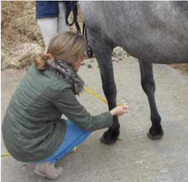
25. PERIMETER OF ANTERIOR CANNON BONE