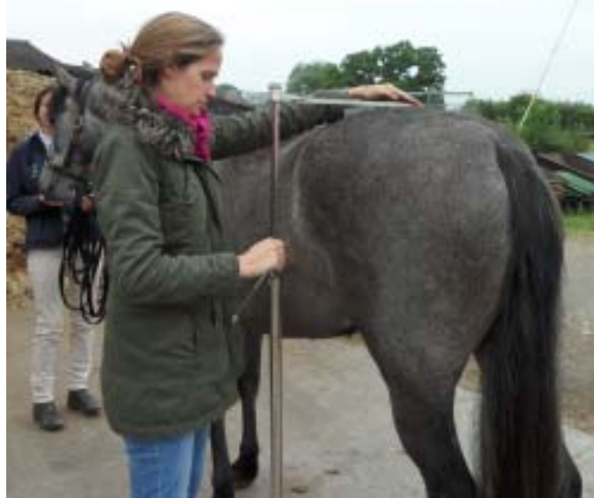
4. HEIGHT AT POINT OF CROUP