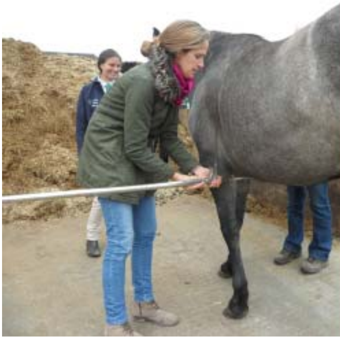
13. BICOSTAL DIAMETER