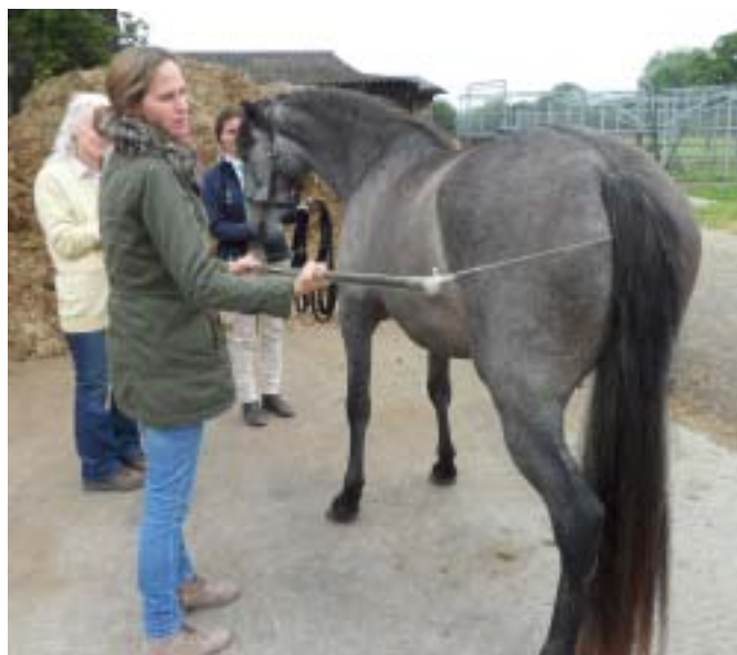
5. SCAPULAR-ISCHIAL LENGTH