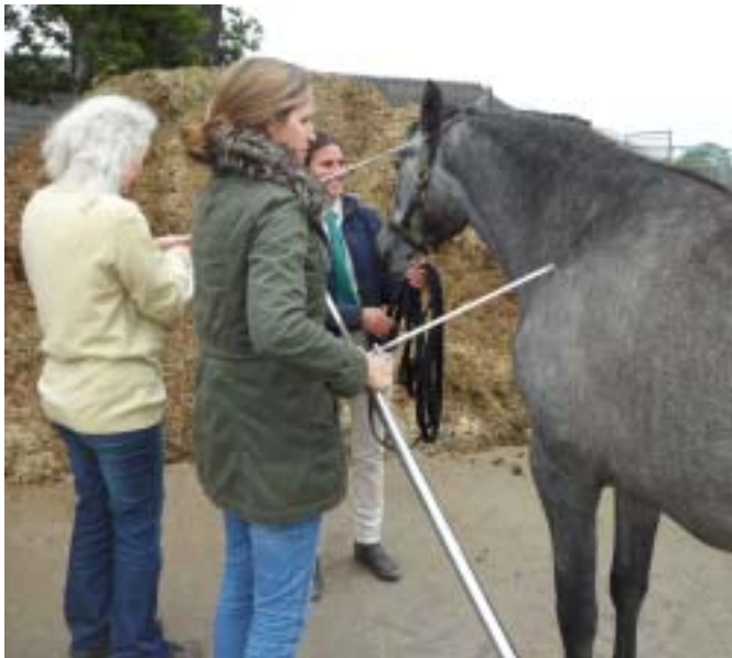
8. LENGTH OF NECK