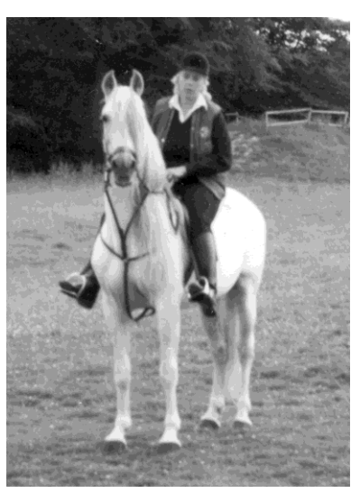
Right: Orgulloso - Andalusian stallion but pedigree unproven