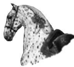
Spanish Spotted Saddle Horse