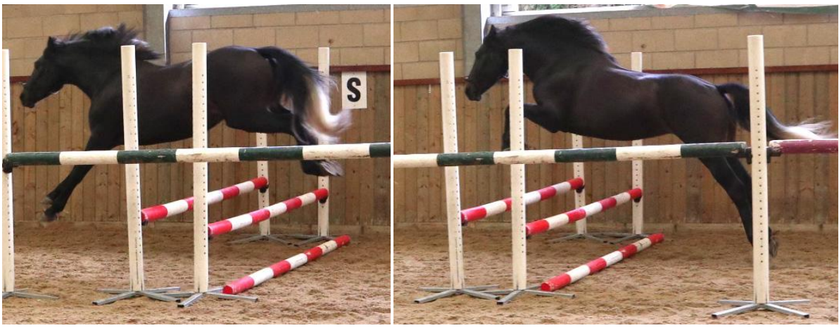
ORV Bandit - Gold Medal Approved PRE Fusion Horse - Graded at 3yrs old.