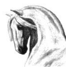
PRE Fusion Horse